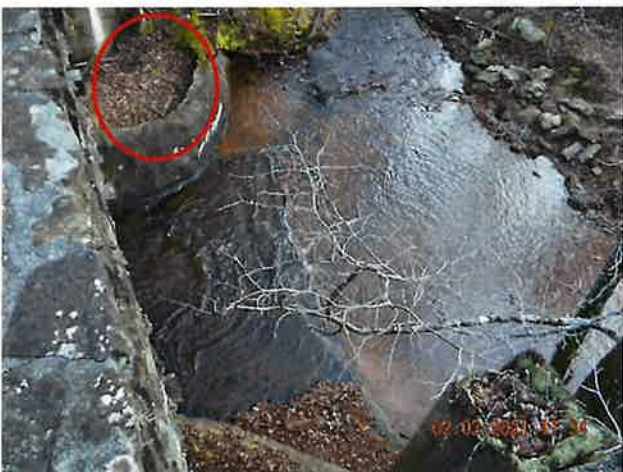
principal spillway plunge pool; notice voidspace behind left wall