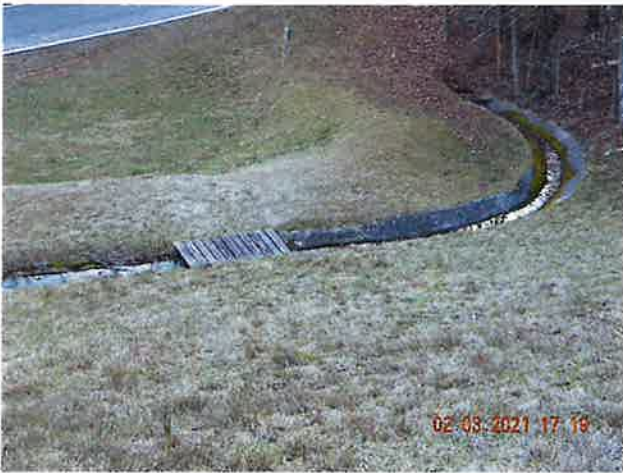
seepage flowing in ditch in lower downstream slope