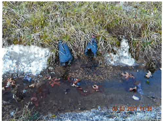
deteriorated black corrugated pipes draining into lower ditch