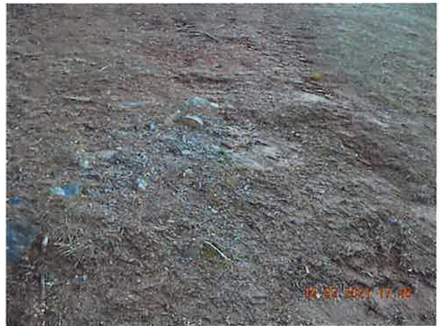
bare area on upstream slope