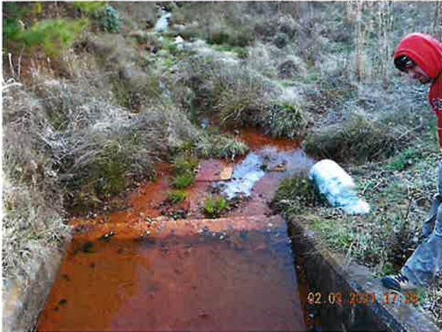
flow from low-level outlet, looking downstream at low-level outfall