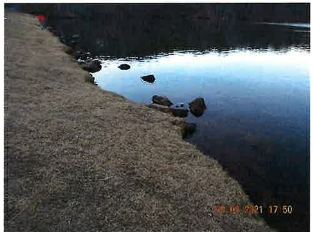
riprap displaced down upstream slope; wave-action erosion apparent