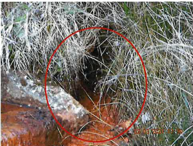
seepage from voidspace behind left wall at low-level outfall