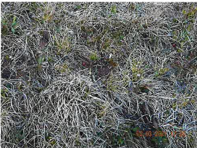
apparent seepage and soft ground on lower downstream slope