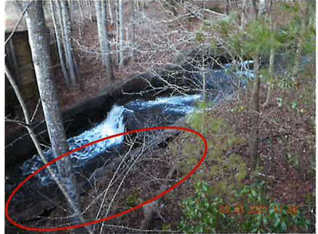
voidspace behind left wall along principal spillway