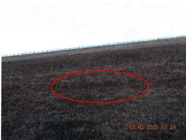
bare spots on lower downstream slope