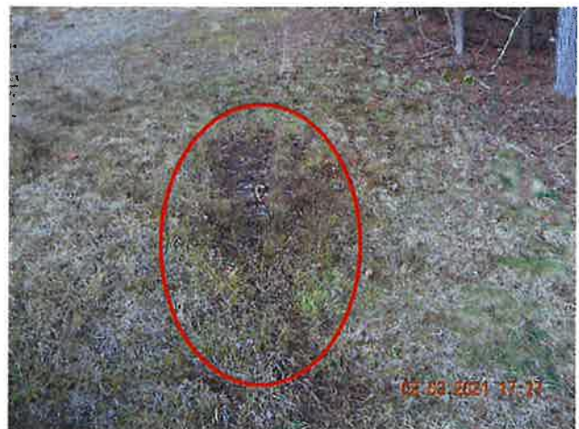
seepage on lower left abutment