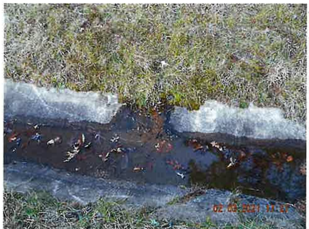
seepage into lower ditch