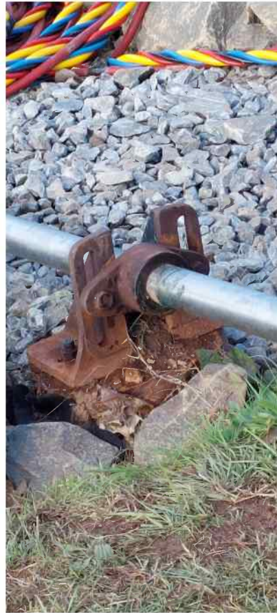
One of the 37 stem guides bolted along Lake Petit Dam

A: Crews are exploring whether to replace all 37 stem guides. Each of the cast-iron pieces is bolted to concrete piers, which are spaced at 10-foot intervals along the lake side of the dam ( see diagram below ). Whether it's more prudent to replace all of the stem guides at once and to look at also replacing the concrete piers to which they are attached is something that will be explored.